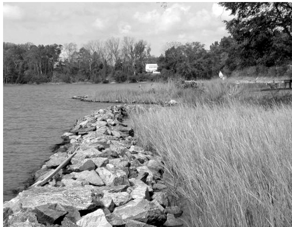
Erosion control using low profile rock riprap with planted marsh.

particular, the complex interrelated nature of the upland and aquatic systems. However, the "armoring" of the shoreline against erosion, with the accompanying loss of most of the living aspects of the shoreline, continues at an ex-